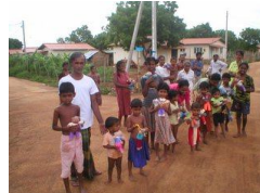
New homes and teddies donated by OST