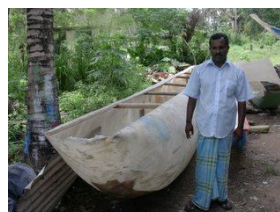
New boat under construction