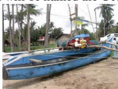
Tsunami damaged boat

The Tsunami Response Management Committee of Weligama Methodist Church also told us about a local fisherman whose boat was badly damaged by tsunami and now he together with his 10-crew members can no longer work. I am pleased to say that OST has now secured £1200 sponsorship from BP Shipping to fund the purchase of the new fishing boat. This will now provide an income to 11 eleven families and will indirectly help 60 people get on with their lives. The boat will be named the Ocean Star.